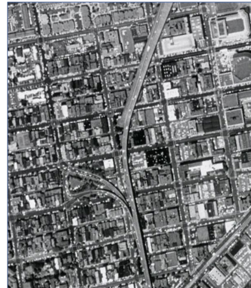
Before – Central Freeway in 1987